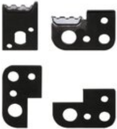
Replacement die for CRIMPFOX-1,6/2,5-ED-2,50

Please be informed that the data shown in this PDF Document is generated from our Online Catalog. Please find the complete data in the user's documentation. Our General Terms of Use for Downloads are valid ( http://phoenixcontact.com/download )